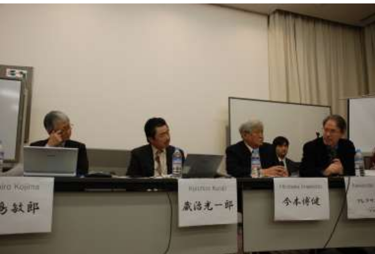
Photo at the symposium